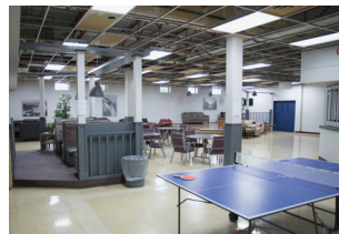
Grace Latrace Memorial Lounge / the Den renovations

Thank you to the donors, workers, and volunteers who helped make these projects happen! We will continue to pray for wisdom as we make strategic investments in the facilities with which we have been blessed.