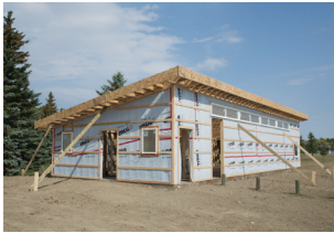
CHS Football clubhouse