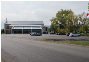
Front entrance parking lot / sidewalk replacement